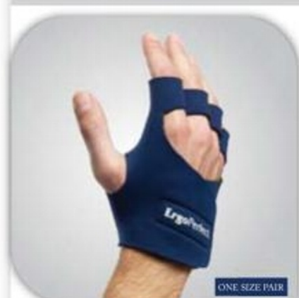
Hand Support • $17.00

ErgoPerfect ergonomic supports are ideal for use during work and other physical activities. The unique properties of the neoprene blend provide compression, support and heat retention, which improves circulation, helps keep muscles and joints flexible and promotes healing.