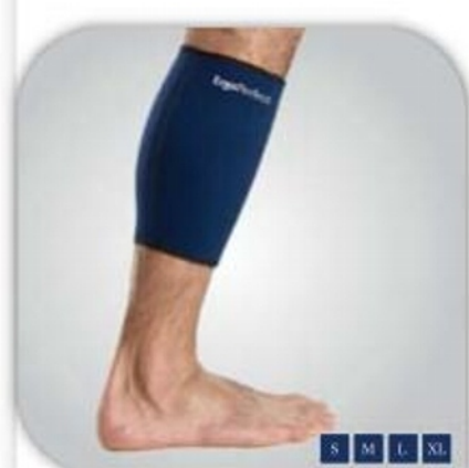
Calf Support • $12.50