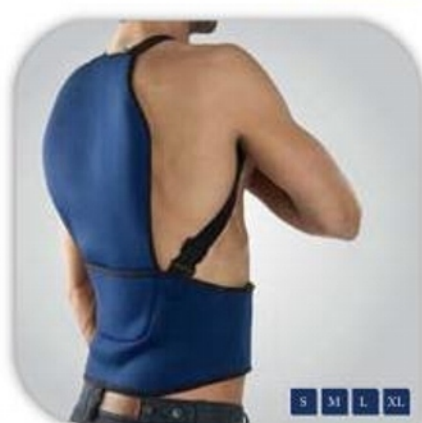
Back Support • $33.50