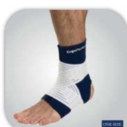
Ankle Support • $12.50