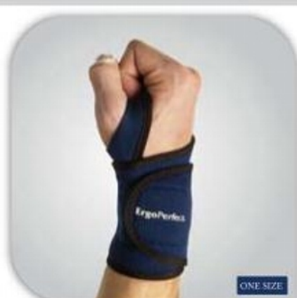
Wrist Support • $12.50