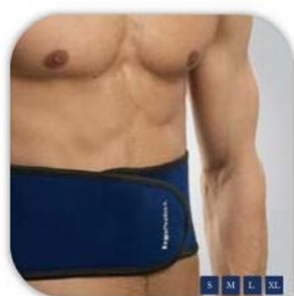
Waist Support • $17.00